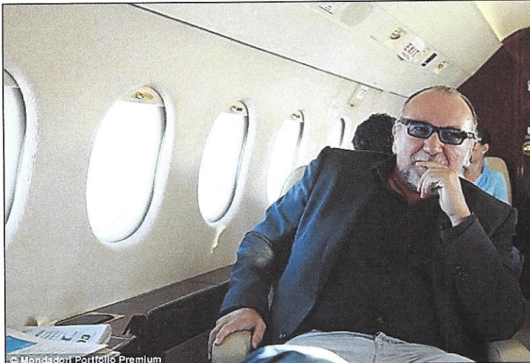
Lawyers for the Albanian government have responded with the intent to appeal the court's decision